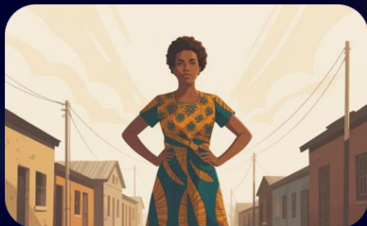
Patricia Nombuyiselo Noah

Trevor's devout, fearless mother who defies apartheid laws to create opportunities for herself and her son. She teaches Trevor to think independently and shows him a world beyond their circumstances. Her name means "She Who Gives Back" in Xhosa.