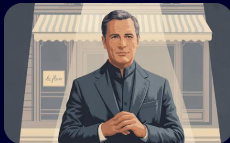
Robert (Trevor's Father)

Trevor's devout, fearless mother who defies apartheid laws to create opportunities for herself and her son. She teaches Trevor to think independently and shows him a world beyond their circumstances. Her name means "She Who Gives Back" in Xhosa.